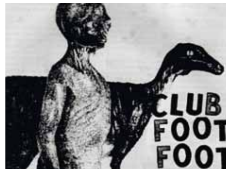
Club Foot Foot

Join film magpie Casey Raymond for a Jubilee celebration of our reptilian overlord with a collection of short films, video and found footage. Our regular Club Foot Foot nights bring you the cream of cinematic art, trash, fantastic crap, forgotten gems, curios and bagpipes for the eyes.