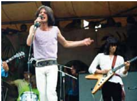
The Stones In The Park

This 1972 music festival in Los Angeles marked the seventh anniversary of the Watts riots and set out to be an African-American answer to Woodstock, featuring superb appearances from Rufus Thomas, Issac Hayes, The Staple Sisters, The Bar Kay and Albert King. To enable as many members of the black community in LA to attend as possible, tickets were sold for $1. The festival had euphoric support from Richard Pryor who discusses the black experience in America and Rev Jesse Jackson who presented his 'I Am Somebody' poem to the assembled stadium crowd. A vibrant and vital document of American cultural history.