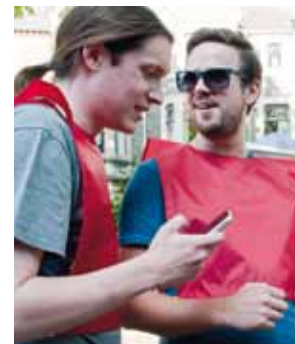
playARK Games Festival

Keep an eye on www.playARK.co.uk for announcements and look out for more details in the July Chapter brochure.