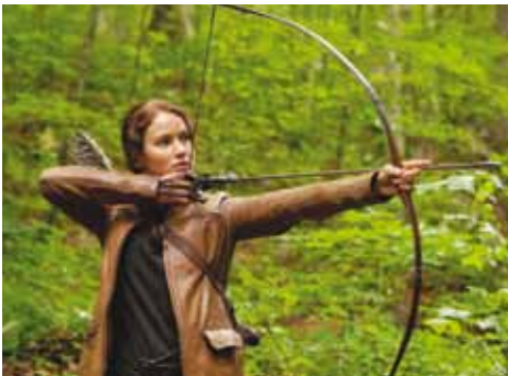
The Hunger Games

In a future where the Capitol selects a boy and girl from the twelve districts to fight to the death on live television, Katniss Everdeen volunteers to take her younger sister's place for the latest epic match.